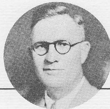
JUDGE BALLARD COLDWELL