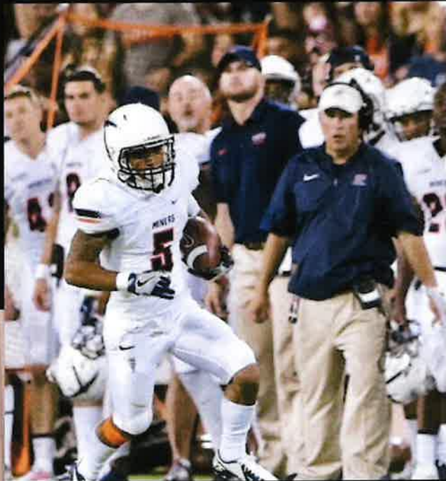
High school football: week 8