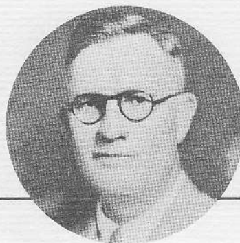
JUDGE BALLARD COLDWELL